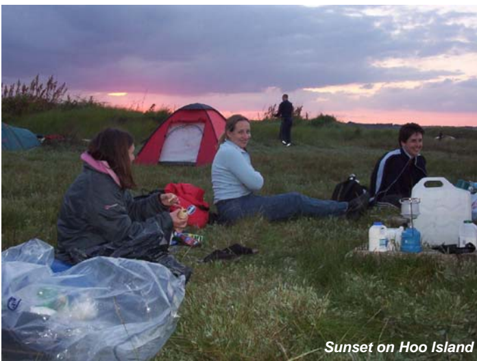
Sunset on Hoo Island