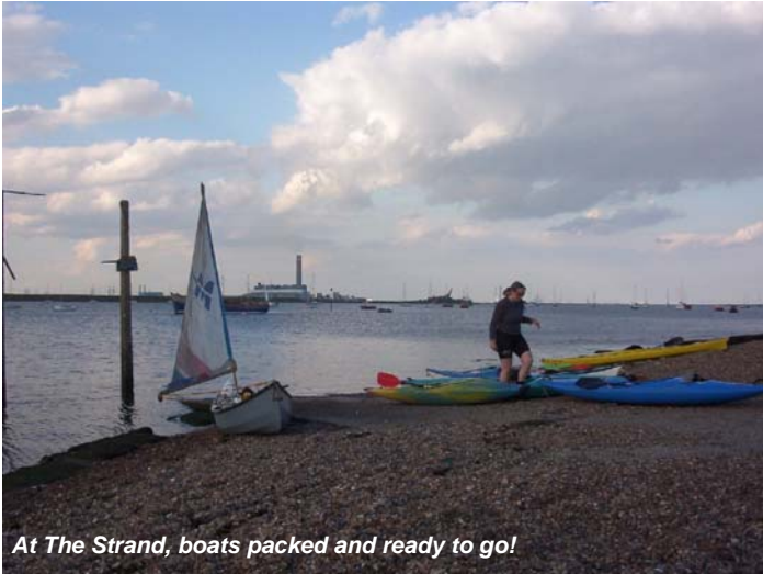
At The Strand, boats packed and ready to go!

As we gathered in the club car park and pulled out boats for those who needed them, all eyes were on the weather, it was starting to cheer up! So with time being very important for catching the tide we set off in a six car snake to Gillingham. With Geoff Orford in the lead and Steve Anstee just behind with his 14ft sailing canoe, which was very prominent on the roof of his van and easy to follow. One quick stop at a garage to grab some disposable barbeques and we arrived at The Strand.